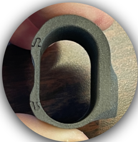
Closed unit, locked and ready to deploy (minus the bird, of course)