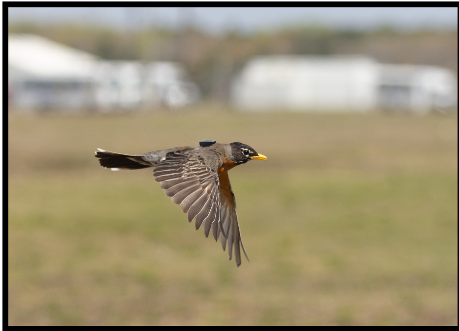
Figure 2: Flicker GPS deployed on an American Robin

This User Guide is a living document. Your experiences and input are greatly appreciated so please don't hesitate to reach out to us regarding what you'd like to see included here. You can submit your suggestions and any errors to our Customer Service Desk here and we will work to incorporate them in future revisions. All material © Cellular Tracking Technologies, 2023.